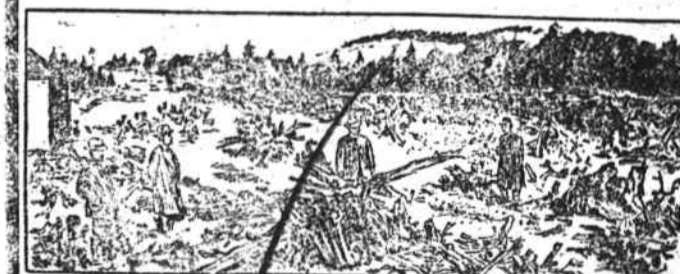
Drawn from actual photograph. Stumps blasted out into firewood.