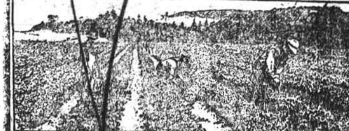
Drawn from actual photograph. Ten months later—$500.00 worth of celery per acre.

Come and learn the modern, quick, cheap and safe way to use the giant force of dynamite to