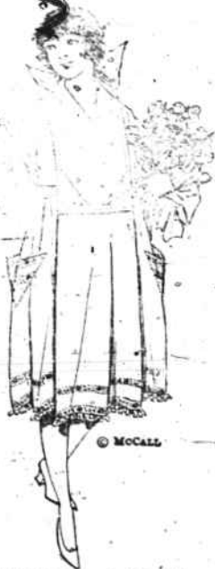
Of Batiste and Fillet Lace.

New York, December 13.—Holiday time is drawing near, when the boys and girls of school age (and any age for that matter) are planning parties and all manner of good times. The question of dainty dresses for the girls has been successfully met, in many in- stances, by frocks of summery materi- als, suitable for our warm American houses and also for the summer festi- vities and warm days. Some of the big stores here in New York are mak- ing quite a specialty of these holiday frocks, this year, and they are refresh- ingly simple and dainty. The materi- als are, in many cases, all-over em- brodery, net, Georgette crepe, muli or organdie, instead of the more elaborate