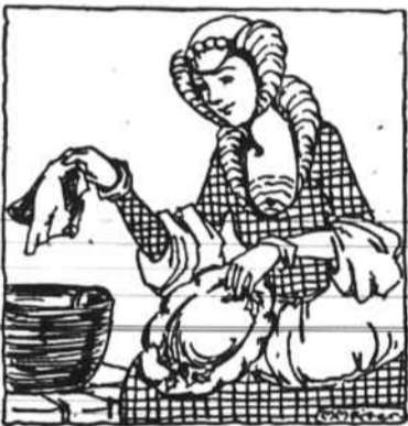
Really Quite Glad.

"You haven't forgotten your manners. That was a most polite speech." She laughed and continued: