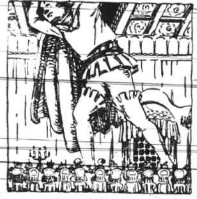
"Off With the Roof."

Now the hurrying and the scurrying sounded nearer, and from all parts