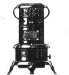
PERFECTION Oil Heaters Instant heat wherever you need it