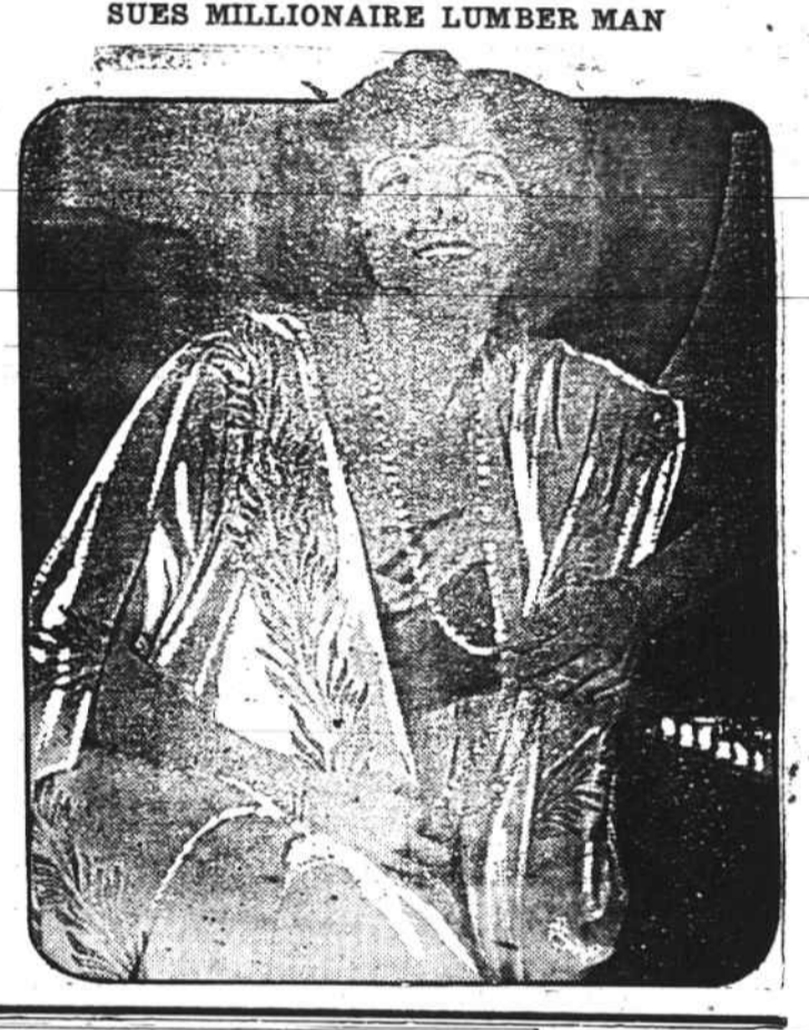
SUES MILLIONAIRE LUMBER MAN