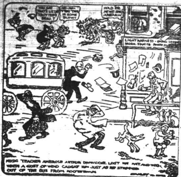
FOUND SEVEN RATS DEAD IN BIN NEXT MORNING. Robert Woodruff says: "My premises were infested with rats. I tried RAT-SNAP on friend's recommendation. Next morning found seven dead rats in bin, two near feed box, three in stall. Found large number since. No smell from dead rats—RAT-SNAP dries them up. Best thing I have ever used." Three sizes, 35c, 55c, $1.25. Sold and guaranteed by Cash Grocery and Market.