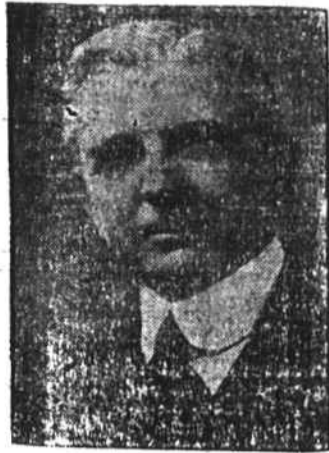
GOV. CAMERON MORRISON