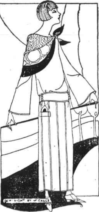
This summer sports costume answers all requirements. The skirt is striped tunic and made with a side opening and single pocket. The low-waisted blouse is made with a narrow belt and full sleeves that fall below the wrist. A printed bandanna handkerchief adds the final blaze of color.