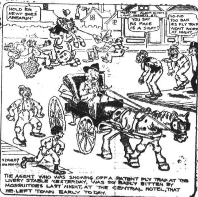
THE AGENT WHO WAS SHOWING OFF A PATENT FLY TRAP AT THE LIVERY STABLE YESTERDAY, WAS SO LADLY BITTEN BY MOSQUITOES LAST NIGHT, AT THE CENTRAL HOTEL, THAT HE LEFT TOWN EARLY TO DAY.

FOR FIRST CLASS JOB PRINTING Phone 383 Subscribe to The Franklin Times $1.50 Per Year in Advance.