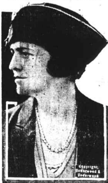
Approved studio portrait of Mrs. Charles Dana Gibson (formerly Irene Langhorne of Virginia) who, it has been announced, probably will second the nomination of Gov. Alfred E. Smith of New York for President of the United States, at the Democratic national convention in New York.

Leaders from among the ranks of the boys and girls clubs of North Carolina will gather at the State College for a weeks short course on June 23. These boys and girls will be under the careful supervision of workers from the extension division during their stay.