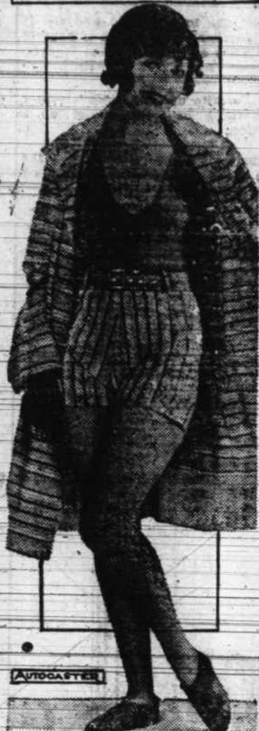
Beach beauties this year have turned to flannel swimming suits.