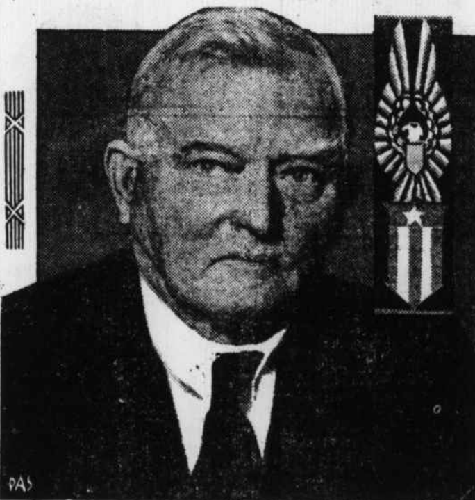
VICE PRESIDENT JOHN N. GARNER

Washington, Dec. 16.—Vice President John N. Garner tonight formally tossed his battered Texas sombrero into the 1940 Democratic Presidential race.