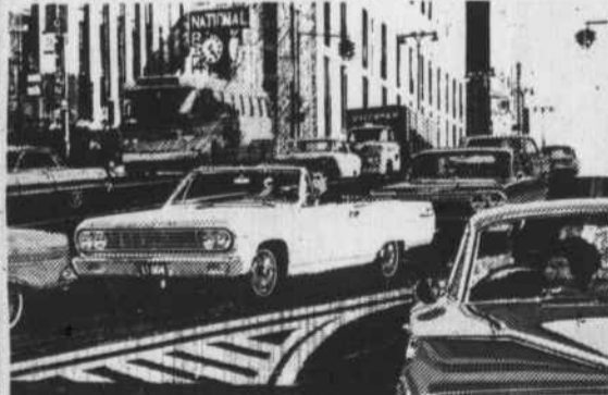
Malibu Super Sport Convertible