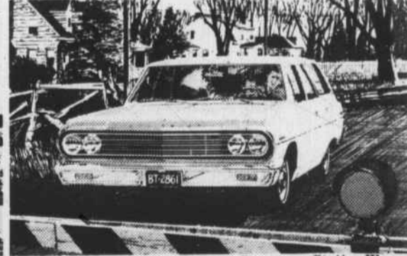
Chevelle 300 6-Passenger Station Wagon