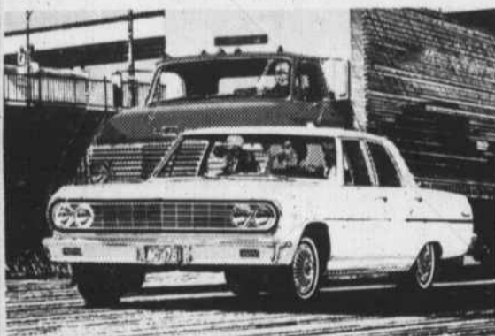
Malibu 4-Door Sedan