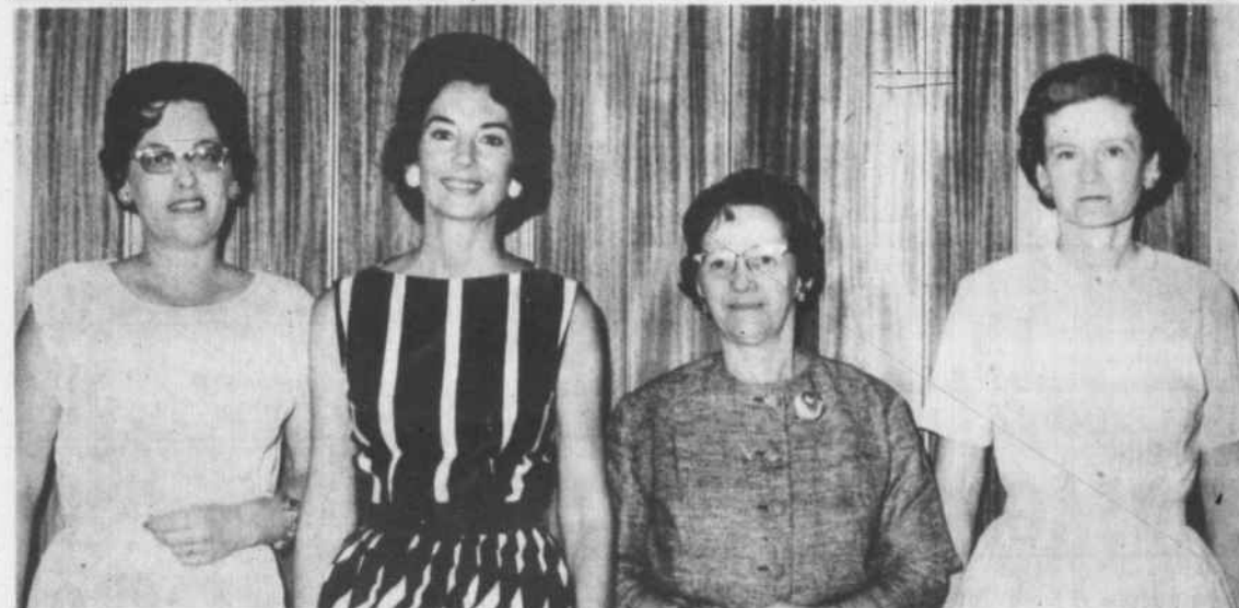
Plant Officials Visit