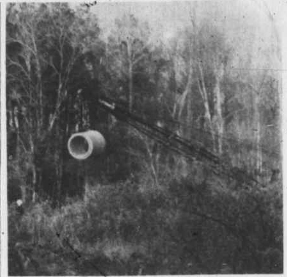
Building College Baseball Field