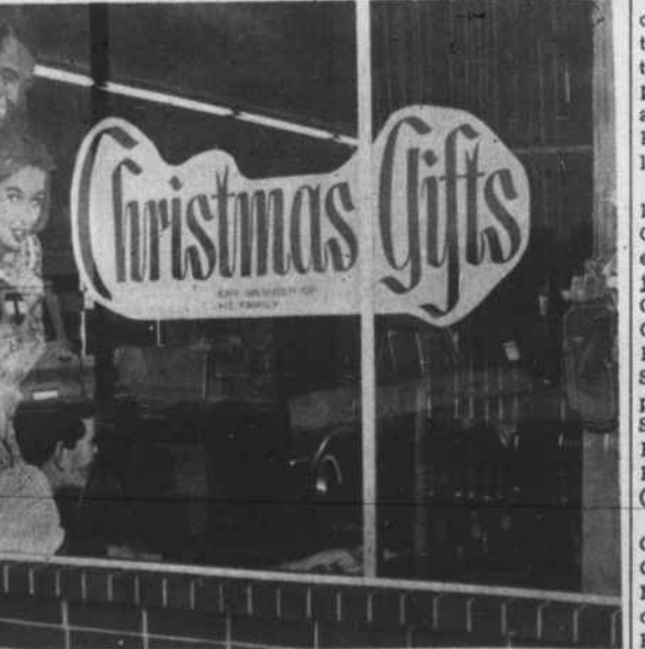
Window Shot As Warning