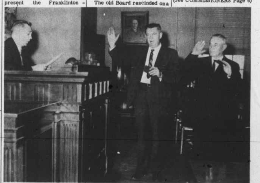
New Commissioners Sworn