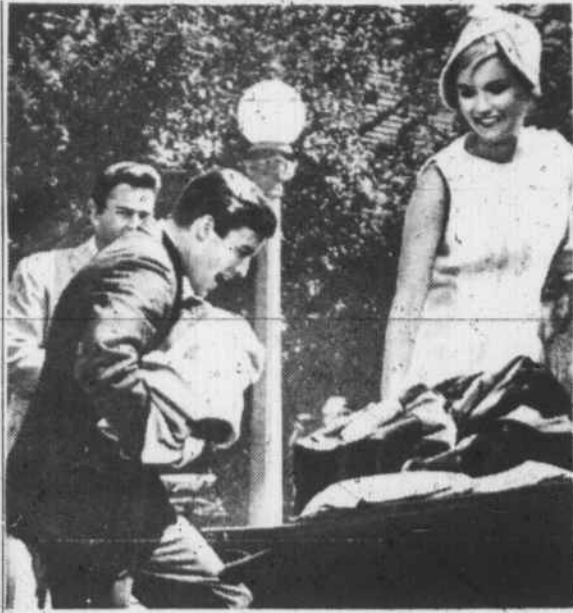
Richard Chamberlain, baby in arms, joins wife Yvette Mimieux as they prepare to drive away to a new life in a scene from "Joy in the Morning." The heart-warming story of the struggles of a young couple to make their marriage a success is based on Betty Smith's best-selling novel. Arthur Kennedy and Oscar Homolka co-star in the Metro-Goldwyn-Mayer attraction.

I saw you coming out of a saloon last night late. Well, I had to come out sometime.