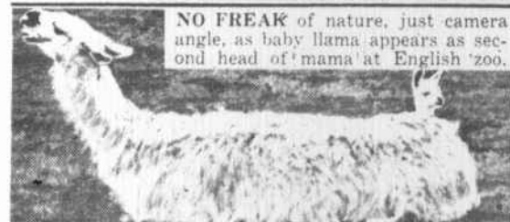
NO FREAK of nature, just camera angle, as baby llama appears as second head of 'mama' at English 'zoo.