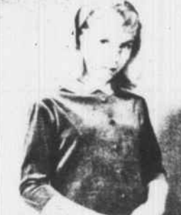
GLOWING —Cotton velvet in a rich shade of blue shapes this princess style with three-quarter sleeves. Covered buttons mark the center front, and oyster white collar and cuffs provide contrast. By Cinderella.

Except for a few resident fish which remain in southern Florida, winter sees almost