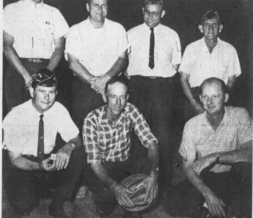
New Legion Officers

The move was not made at the request of the local Extension Agents or any local group, but it was made in order to comply with guidelines handed down from Washington in compliance with Civil Rights Legislation, said Dean.