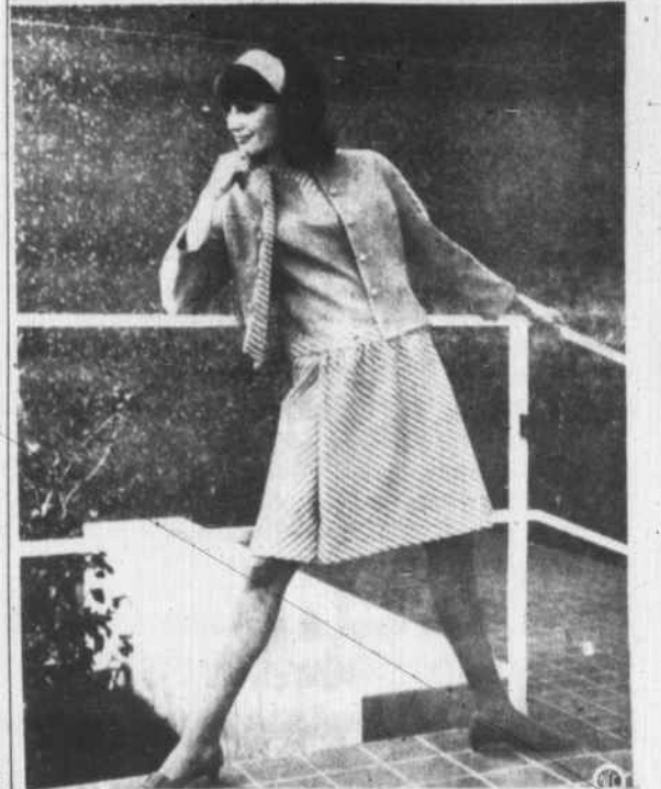
WINNING COMBINATION — The skillful interplay of stripes and solids gives an important fashion look to this two-piece cotton knit costume. Brass stripes are combined with powder blue in the low-waisted, easy-fitting dress and matching jacket. A perfect outfit for the young woman-on-the-go, it's by Renee Firestone of California.

After everyone had been served fruit punch, bridal cake, coconut twirls, nuts, mints, and cheese straws, the bride-elect was presented a gift of silver by each of the co-hostesses.