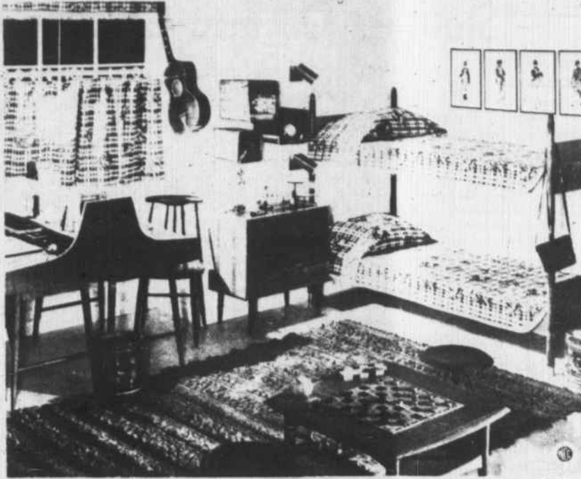
DECORATING TIP —Let the bedspread be your color guide in planning room decor. Here, regimental colors of red, white, and blue set the pace for a boy's room. Military figures are screen-printed on Morgan-Jones' sturdy cotton spread and matching cafe curtains. The same print is available in cotton thermal blankets. All are machine-washable—need no ironing.