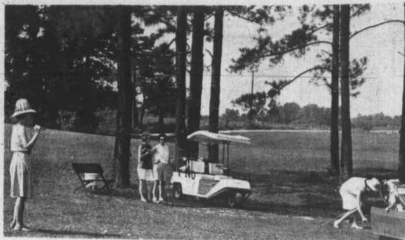
Club Women Participate In Memorial Tourney