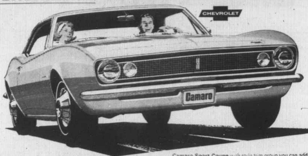
Camaro Sport Coupe with style trim group you can add.

You've been waiting for a Chevrolet like this. Now it's here.