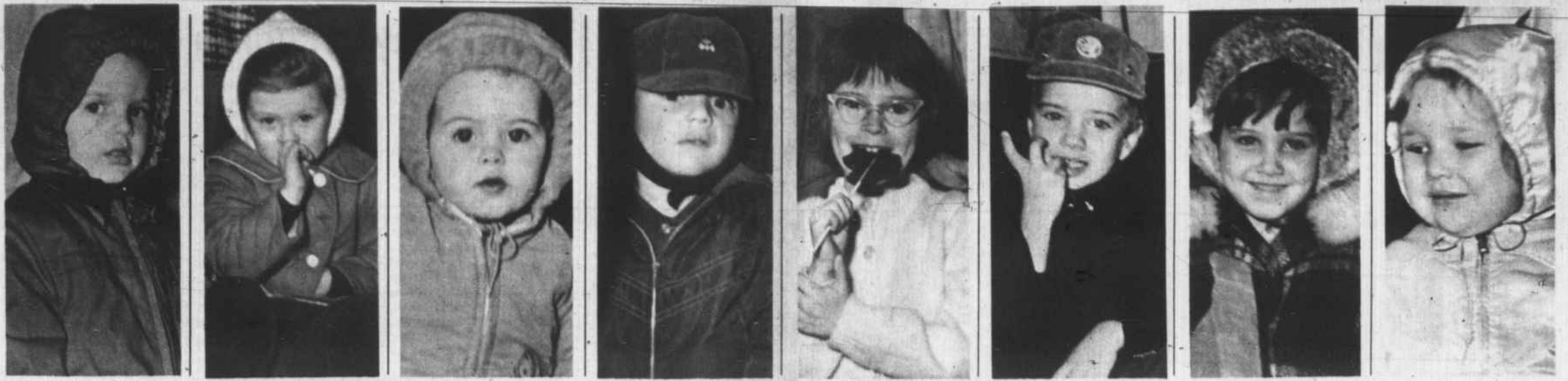
Waiting For Santa Claus: Christmas Is The Look On A Child's Face