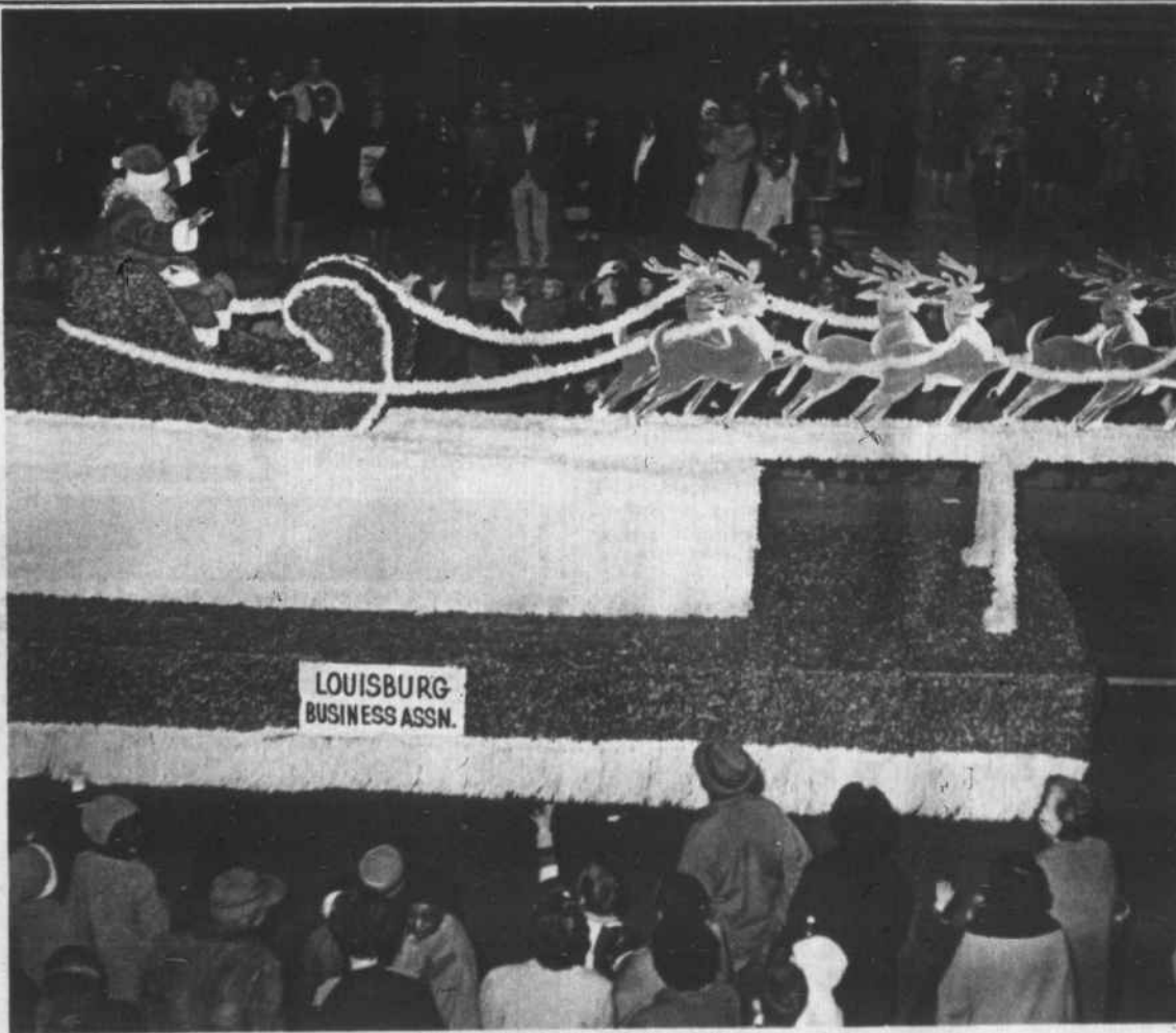
Here Comes Santa Claus

Louisburg High School led the parade with Webb High School Band of Oxford and the South Granville High School Band of Creedmore also participating. There were Cub Scout marches, a marching group from Youngsville Elementary School and others. The traditional horse riders brought the end of the parade with Santa Claus riding atop the largest float, waving and voicing greetings to the hundreds of youngsters along the mile and a quarter route.