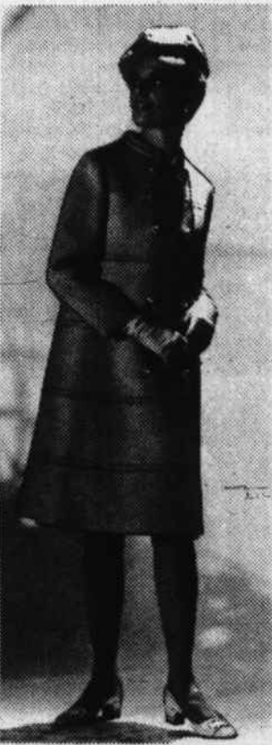
Subtle fullness toward the hem, horizontal seaming highlight this spring coat, of double-faced gabardine. Suggested by National Board, Coat and Suit Industry.