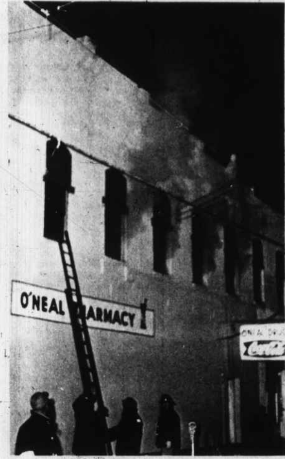
Through The Walls Too

The best way to break a bad habit is to drop it. -Spotlight, San Diego, California.