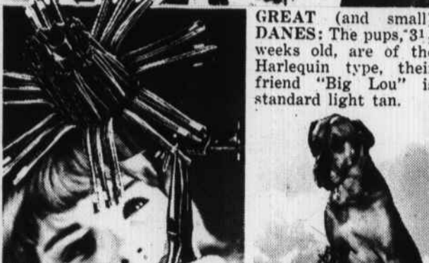
GREAT (and small) DANES: The pups, 3 1/2 weeks old, are of the Harlequin type, their friend "Big Lou" is standard light tan.