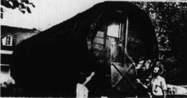
TREE HOUSE actually carved from trunk of California redwood 1,000 years old, shown en route from Coast with its owner, Len Wood (are you kidding?) of Los Angeles, to Expo 67 in Montreal.