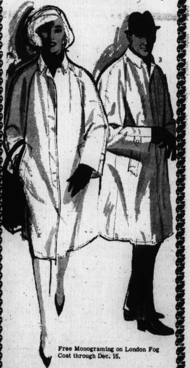
Free Monogramming on London Fog Coat through Dec. 15.