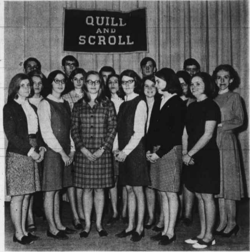
Quill And Scroll Society Members

The basketball season is rounding the last bend this week and next as tournaments get underway. Louisburg plays Franklinton Tuesday night and Youngsville Wednesday night at Louisburg. Thursday night, tournaments will begin. Good Luck to everyone!