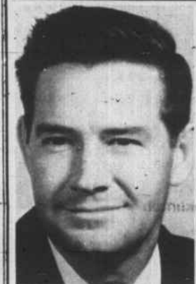
FARM BUREAU LIFE INSURANCE