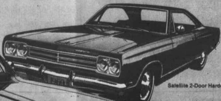
Satellite 2-Door Hardtop