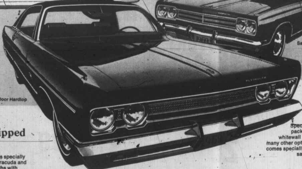
Fury III 2-Door Hardtop