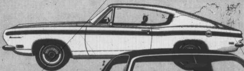
Barracuda Sports Fastback

AUTHORIZED DEALERS CHRYSLER MOTORS CORPORATION