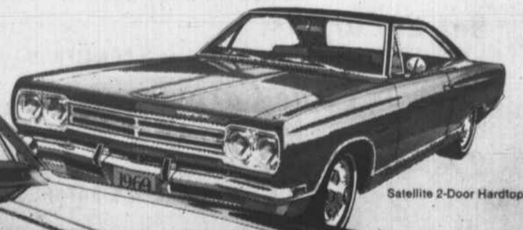
Satellite 2-Door Hardtop