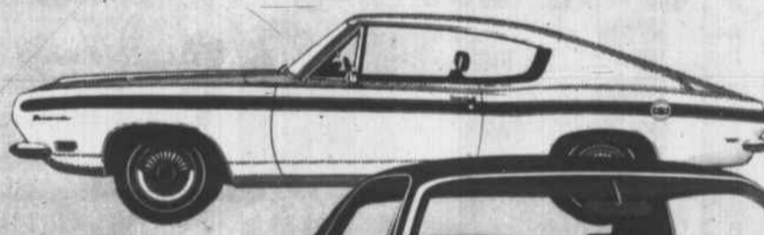
Barracuda Sports Fastback

AUTHORIZED DEALERS CHRYSLER MOTORS CORPORATION