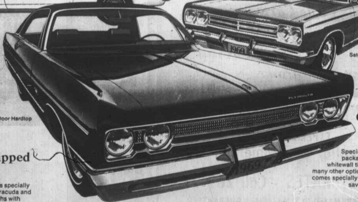
Fury III 2-Door Hardtop