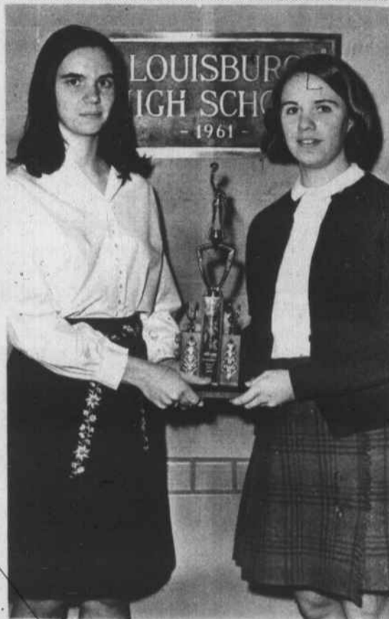
Louisburg Girls, Gold Sand Boys Win Coveted Sportsmanship Awards