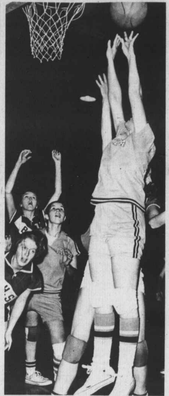
Bunn - Youngsville Girl's Tangle in Championship Game