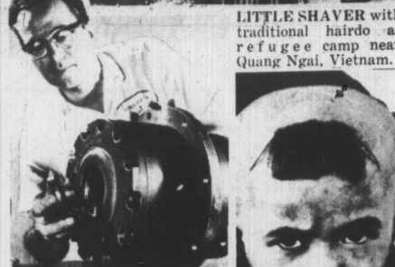
LITTLE SHAVER with traditional hairdo at refugee camp near Quang Ngai, Vietnam.