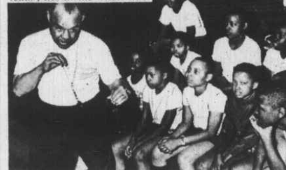
STILL CHAMP: Henry Armstrong, 56, only boxer ever to hold three world titles simultaneously, instructs youth at Herbert Hoover Boys' Club, St. Louis, in self-defense.

Fishing solves a surprising number of problems.