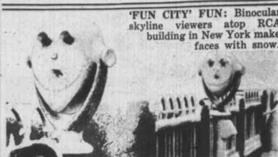
'FUN CITY' FUN: Binocular skyline viewers atop RCA building in New York make faces with snow.