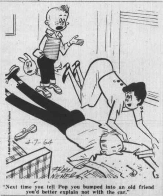
"Next time you tell Pop you bumped into an old friend you'd better explain not with the car."

FOR INFORMATION CALL 496-3460 ANYTIME OUR ANSWERING SERVICE