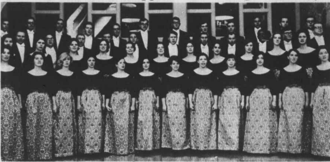
The Westminster Choir, the world famous choir, appears at Louisburg College Monday evening, March 24, at 8 p.m. in the College Auditorium and is one of the Louisburg College Concert Series. All tickets have been sold. The Choir is a carefully matched and selected group of 40-voices performing in 26 cities in 12 states during February and March. Maestro Leonard Bernstein once commented, "Westminster Choir College supplies a great measure of beauty to the world that needs it."