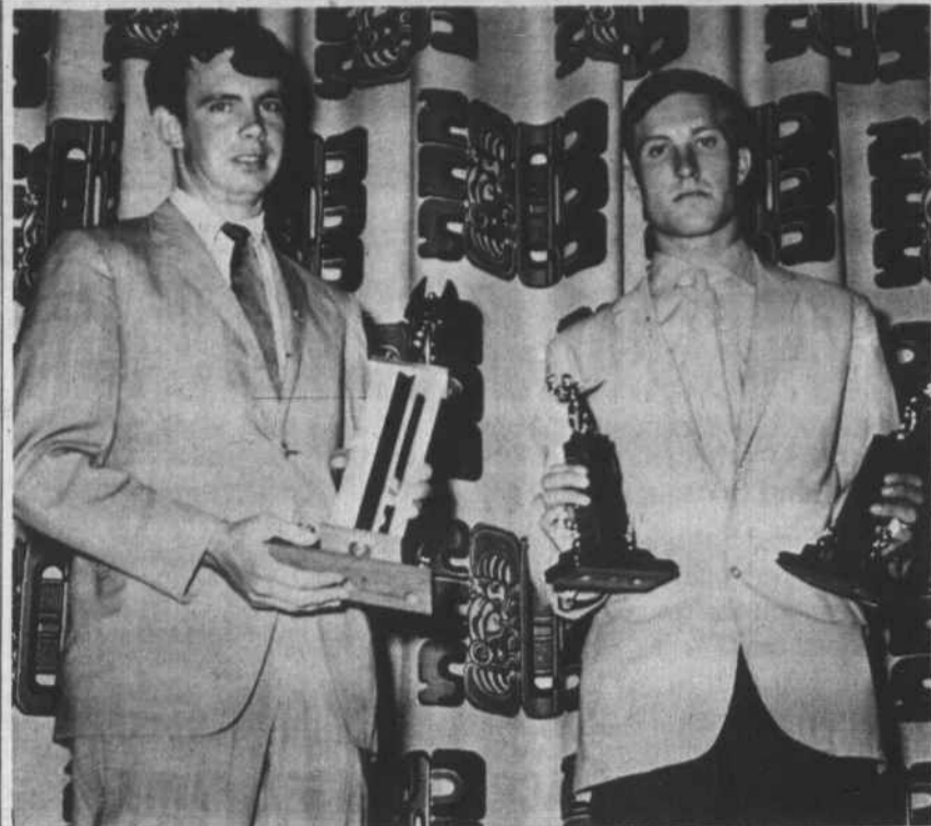
Most Honored Athlete in LHS History