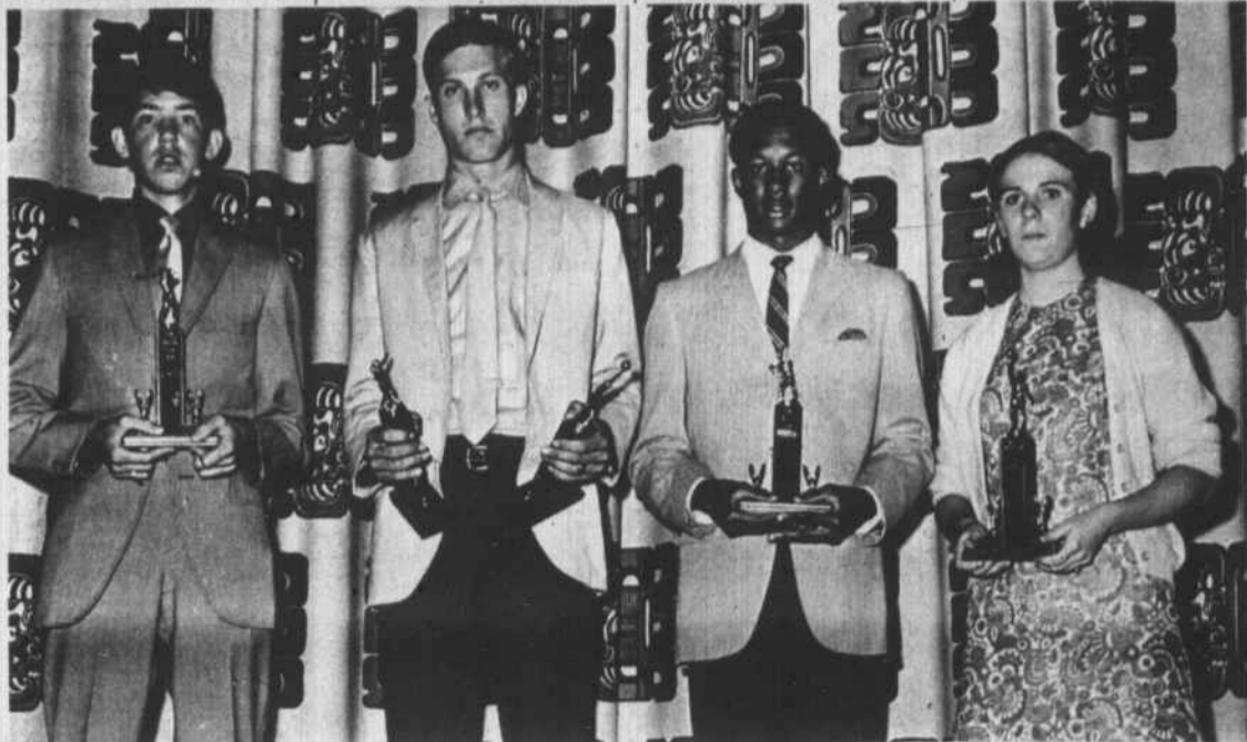
Most Valuable Players