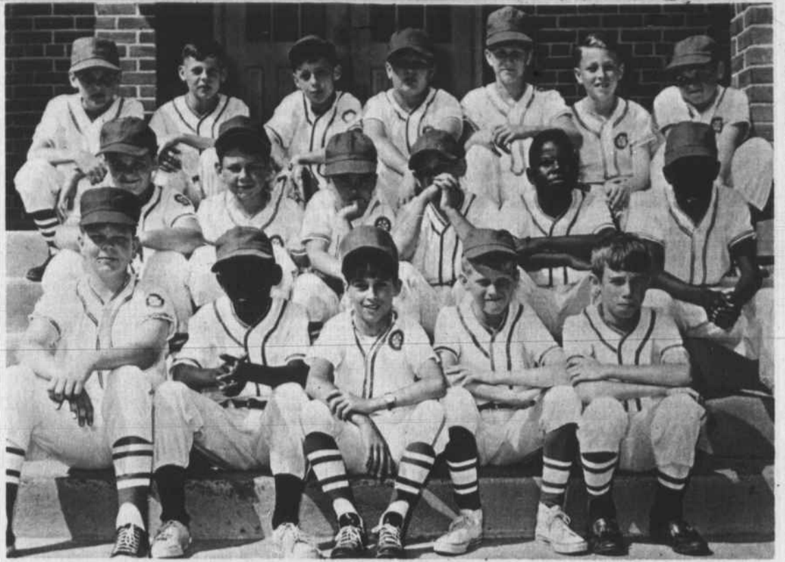
Bunn Little League