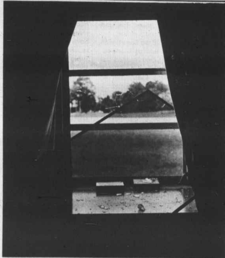
Duke Memorial Church At Justice