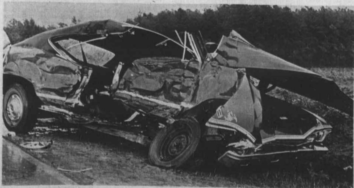
NC-56 ACCIDENT PUTS FIVE IN HOSPITAL

A three-car crash just across the Franklin line in Vance County on US-1 Sunday afternoon killed a State College student and injured twelve other persons. Franklin Troopers report a host of minor accidents over the rain plagued weekend.