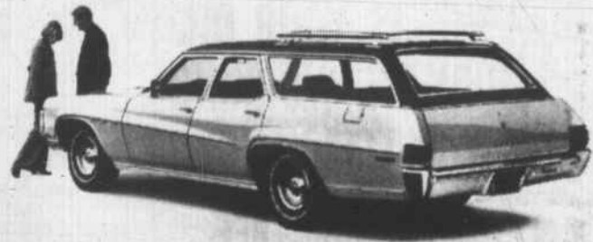
1970 Buick Estate Wagon. Totally new. A full size wagon with a 124-inch wheelbase. The longest you can buy.