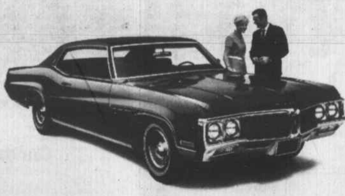
1970 Buick LeSabre Custom 2-door Hardtop. With a 124-inch wheelbase. Now available with a 455-cubic-inch V8.