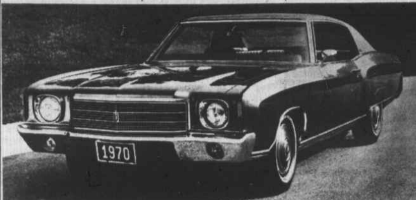
A new concept of elegance is the distinctive Monte Carlo Sport Coupe. This newest addition to the Chevrolet line is characterized by smooth flowing lines and sculptured surfaces dramatically emphasized by the longest hood ever produced by Chevrolet. The plush interior includes a simulated wood burl accent on the instrument panel and extra-thick foam cushioned front and rear seats. The Monte Carlo will be at dealerships on September 18.

combined should mean another treat for Franklin County fans. Game time is 8 P.M.