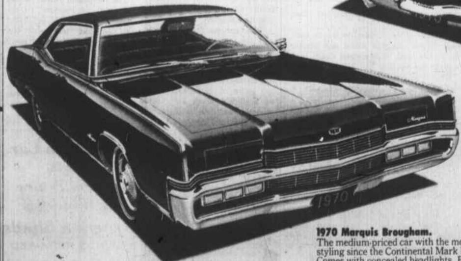
1970 Marquis Brougham. The medium-priced car with the most dramatic styling since the Continental Mark III. Comes with concealed headlights, Emerald-cut taillights. A big 429 cubic inch V-8 powerplant. Select Shift automatic transmission. 1970 Marquis. The most beautiful thing that's ever happened to a medium-priced car.