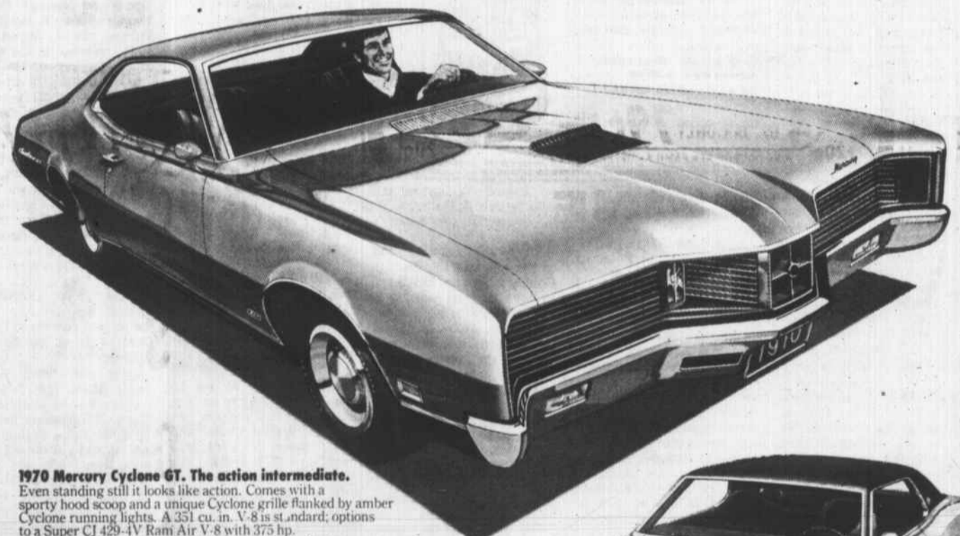
1970 Mercury Cyclone GT. The action intermediate. Even standing still it looks like action. Comes with a sporty hood scoop and a unique Cyclone grille flanked by amber Cyclone running lights. A 351 cu. in. V-8 is standard; options to a Super CJ 429-4V Ram Air V-8 with 375 hp. Inside: Hi-back buckets in cool "breathable" Comfort-weave vinyl. Cyclone GT, Mercury's sporty new street machine that looks like a racing car.