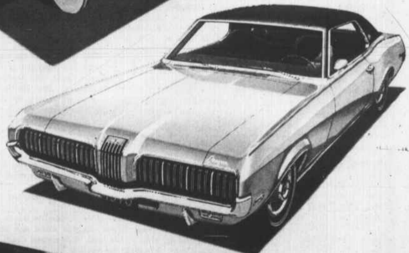
1970 Mercury Cougar XR-7. Where wild meets elegant. Cougar XR-7 has more standard equipment than any of the competition. Hi-back vinyl buckets accented with leather. Built-in map pockets. Tachometer. Elapsed-time clock. Concealed headlights, sequential rear turn signals, 351 cubic inch V-8, and much more. Catch a Cougar XR-7, the wildly elegant one for 1970.