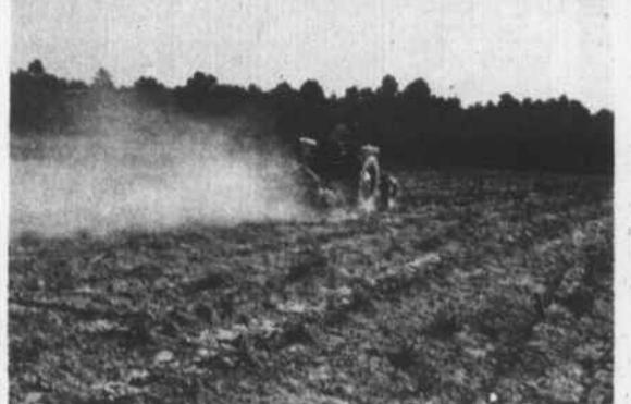
Shown here is Fred Lawrence wno tarms with our mount getting the land ready for seeding oats.