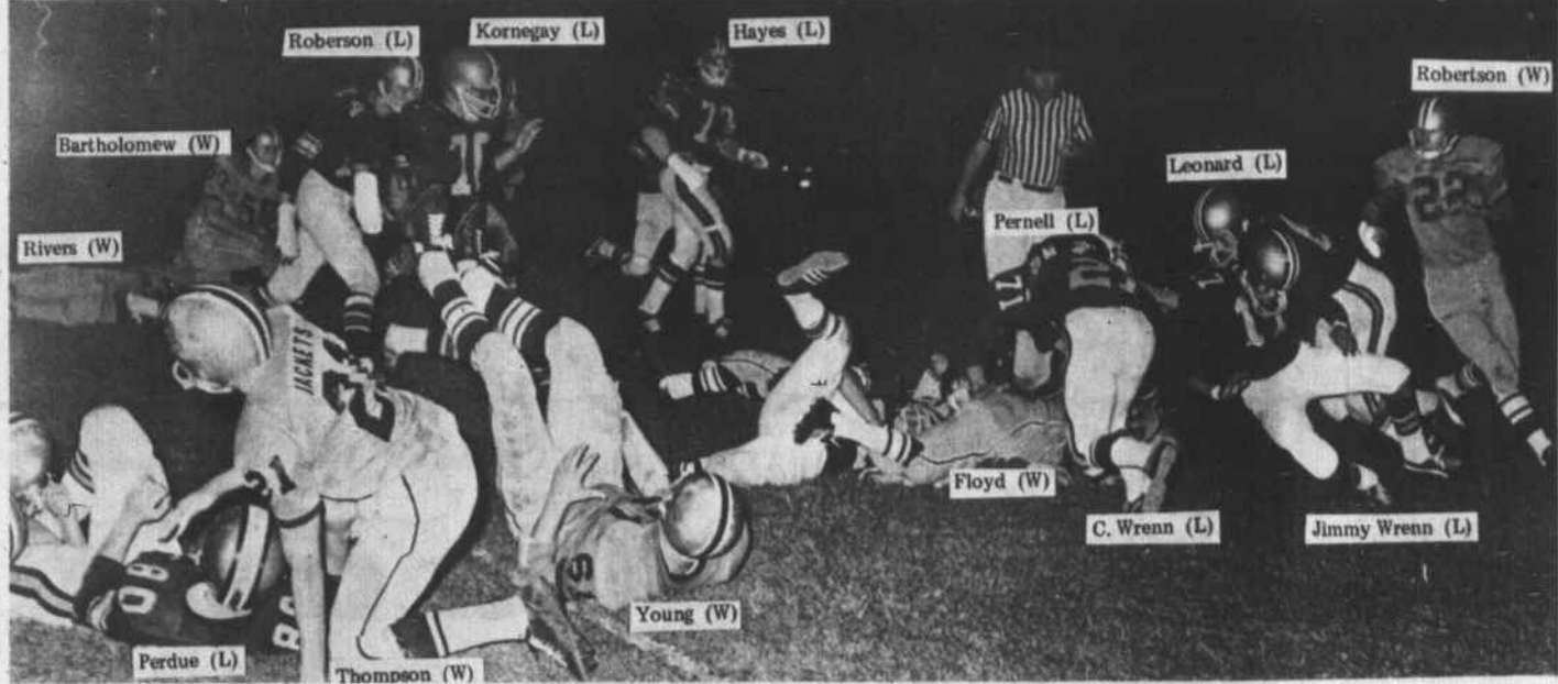
Bulldogs And Yellow Jackets Scattered All Over The Place