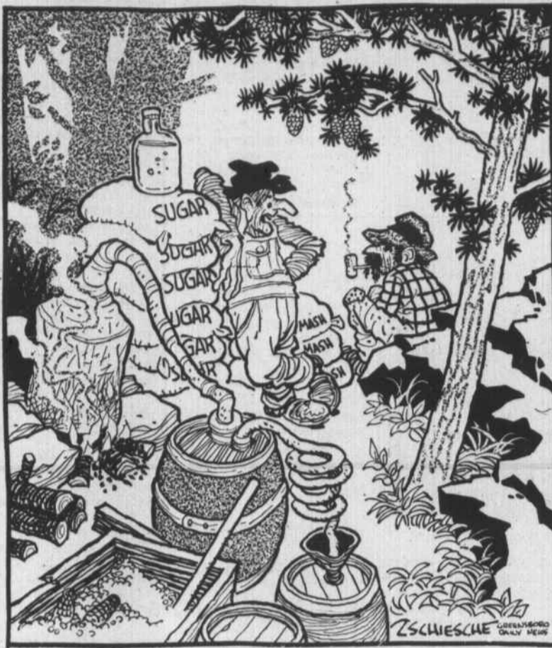
Prisoner of war

'Th' Feds should be plumb tickled, Zeb, that we ain't usin' a dab of artificial sweetnin'...'