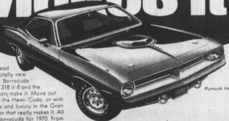
Plymouth Hemi-Cuda 2-Door Hardtop

The Motion Makers, at your Plymouth Dealer's, lead the pack with the totally new Barracuda for 1970. Barracuda styling makes it. The 318 V-8 and the high-back bucket seats, make it. Move out with super-power in the Hemi-Cuda, or with leather bucket seats and luxury in the Gran Coupe. That's motion that really makes it. All new. All different. Barracuda for 1970. From the men in motion at your Plymouth Dealer's.