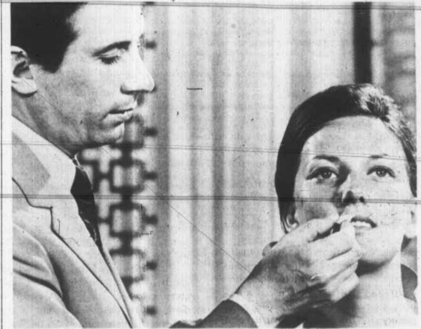
Geranium and Pomegranate are two lipstick shades that can make a mouth "fresh, light, shiny and luscious!" says Pablo. "Follow the natural lip outline and don't blot your lipstick by rubbing your lips together," he warns. Last step is his application of Elizabeth Arden's Creme Blush, a sheer liquid highlighter that adds a transparent glow to the face.

when darkening eyebrows," he warns. "Apply the pencil with light, short strokes resembling brows."