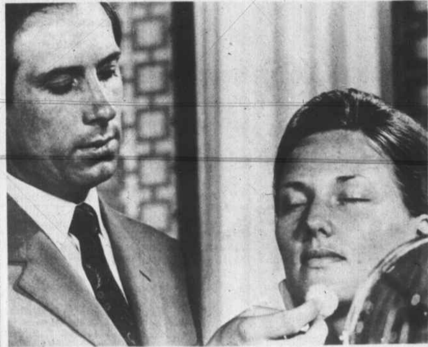
"Use a transparent powder, which will take on the color of the foundation without changing it," says Pablo. "Apply it sparingly under the eyes so as not to accent lines." Next comes a soft, glowing blusher to emphasize bone structure.