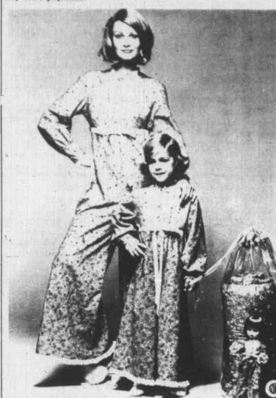
SLEEPWEAR ENSEMBLES —Appropriate gifts for mother and daughter or big and little sister are these cozy cotton sleep culottes. Added gift possibilities for young girls are the matching doll and a carry-all tote packed with sleeping bag and pillow in the same flower-printed cotton. By Slumberbots.