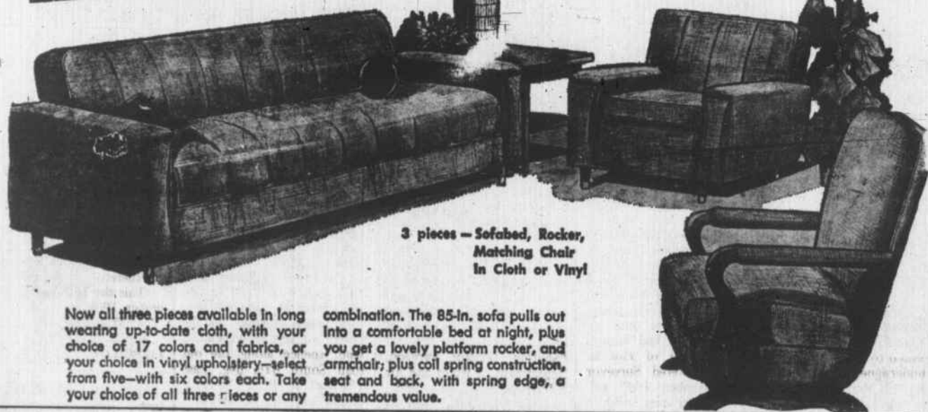
3 pieces — Sofabed, Rocker, Matching Chair In Cloth or Vinyl

Now all three pieces available in long wearing up-to-date cloth, with your choice of 17 colors and fabrics, or your choice in vinyl upholstery—select from five—with six colors each. Take your choice of all three pieces or any