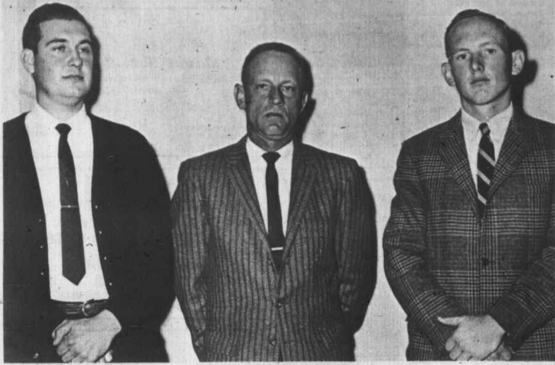
Newly Elected NFO Officers